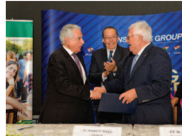
Fransabank signing the MOU with LAU