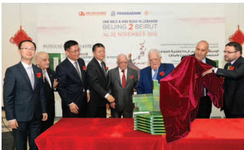
Unveiling the book at Unesco

Conference at Phoenicia Hotel on 25 November, attended by Lebanese, Arab and Chinese officials as well as Banking executives from the Arab Countries "The Chinese-Arab Banking Dialogue" session where Chinese finance and banking sector entities spoke of their experience, plans and strategy in projects and financing within the One Belt & One Road countries.