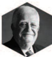
Adnan Kassar 2014 Business for Peace Honoree, Lebanon

2015 witnessed the unveiling of the UN Sustainable Development Goals (SDGs). With a series of 17 global Sustainable Development Goals, it sets a transforming agenda for 2030 breaking through opportunities to transform economies and chart a new course for people and the planet—a future that’s more inclusive, just and sustainable.