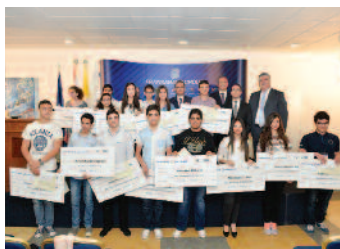
The 15 winners