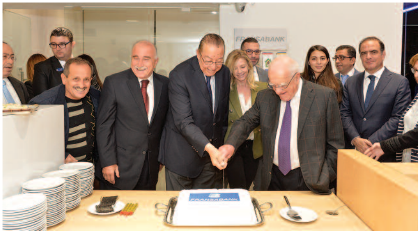
Opening Ceremony of Bliss Branch

Fransabank maintains its policy of expansion in the Lebanese market and thus announced in 2016 the opening of two new branches, the first in Bliss Street, Hamra in Beirut, and the second in Hlalieh, Saida.