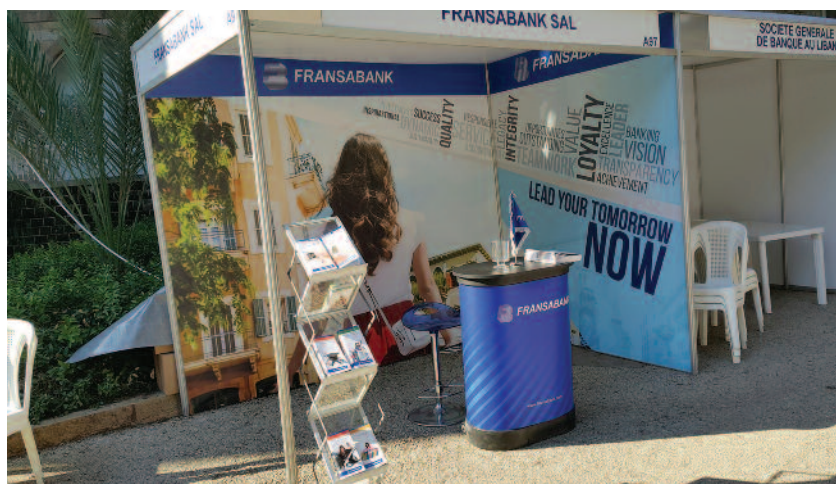
Fransabank's booth at AUB

Fransabank was present at AUB, USEK and USJ's job fairs held in April, 2016 on campuses, where ambitious students seeking suitable employment or looking forward to enhancing their existing careers got the chance to visit Fransabank booth and learnt more about the bank's potential job opportunities or internship programs.