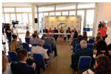
Overview of the Press Conference