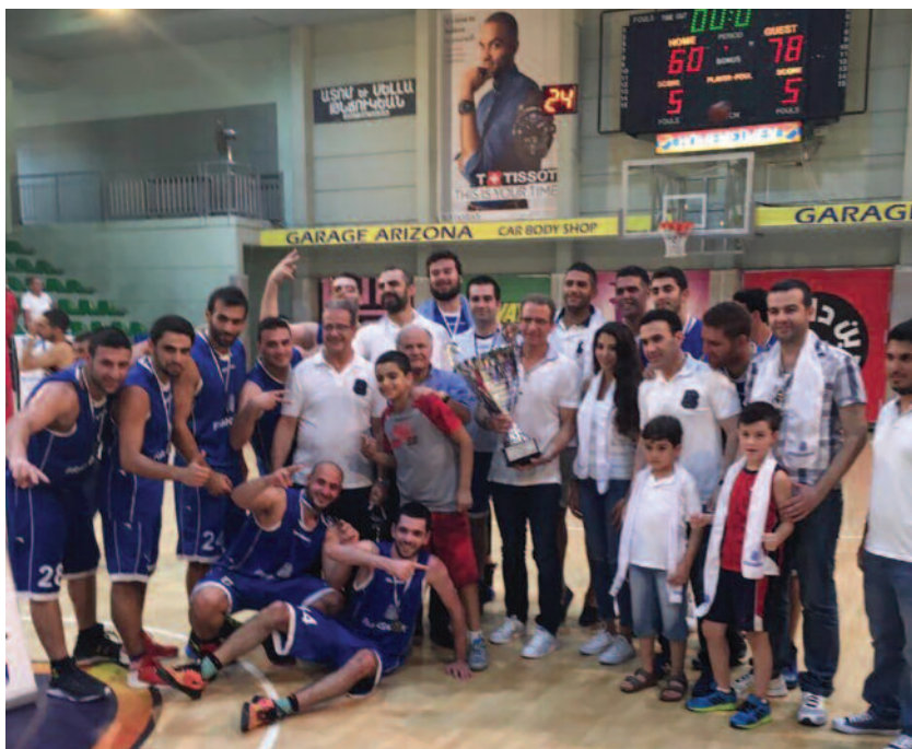
Fransabank basketball team

After 18 matches, Fransabank Basketball Team was crowned Champions of the Banks Basketball League 2016 during the grand final game on Sunday June 19 th at Homenetmen Stadium – Bsalim, Mezher. The competition, held by Sports Mania and sponsored by The Lebanese Basketball League featured Bank Credit Libanais v/s Fransabank and ended on a score of 78-60.