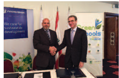
Signing of a Memorandum of Understanding with E-Eco Solutions for the Green Schools Certification Program to support schools in their "greening" process