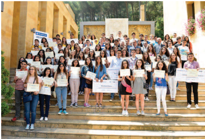
The 120 winners

Fransabank awarded 120 students and distributed cash awards of US$ 22,500 to 15 students who participated in the educational contest launched by Fransabank earlier in March, "Talents for Lebanon". The initiative came within Fransabank's firm commitment to corporate social responsibility and its solid belief that students of today are the builders of tomorrow, and in the context of its cooperation protocol signed with the General Secretariat of Catholic Schools in 2013.